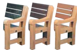
Light Oak Ends