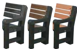
Black Oak Ends

Seat Slat Colour Options: Black Enviropol, Brown Enviropol, Timberpol. Seat End Colour Options: Black Oak, Dark Oak, Light Oak.