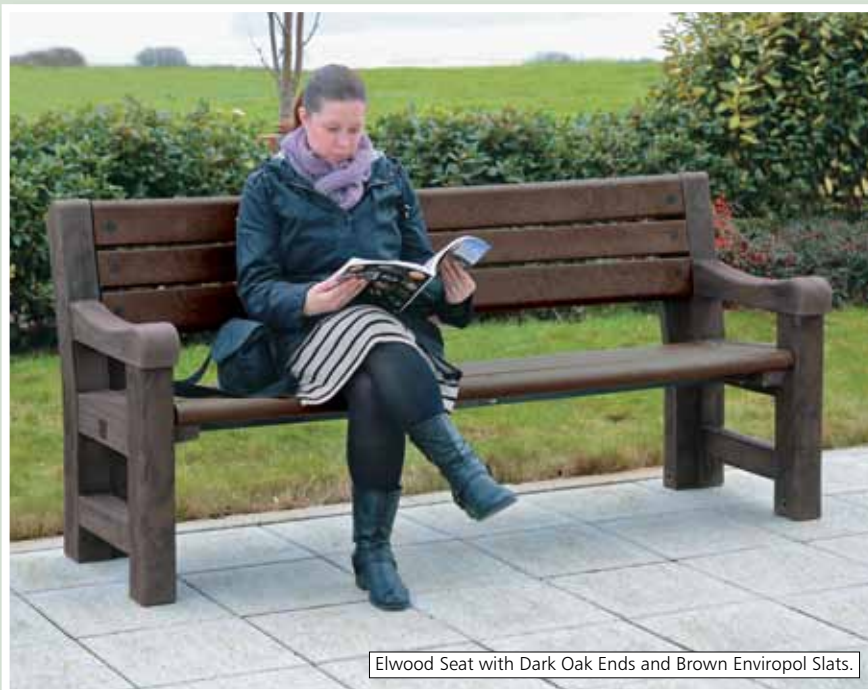
Elwood Seat with Dark Oak Ends and Brown Enviropol Slats.

Elwood combines traditional timber effect seat ends with hardwearing seat slats. This combination creates a strong seat with a unique, realistic timber grain finish that requires minimal maintenance. Elwood seat is vandal and weather resistant, it will not rot, warp or crack and does not need regular surface treatments.