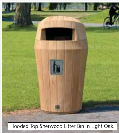
Hooded Top Sherwood Litter Bin in Light Oak.

Sherwood is manufactured from Everwood material, a unique, realistic timber grain polymer. Sherwood is a robust litter bin that requires minimal maintenance. It is available with an open top or a hooded top in Light Oak or Dark Oak.