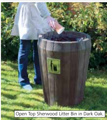
Open Top Sherwood Litter Bin in Dark Oak.