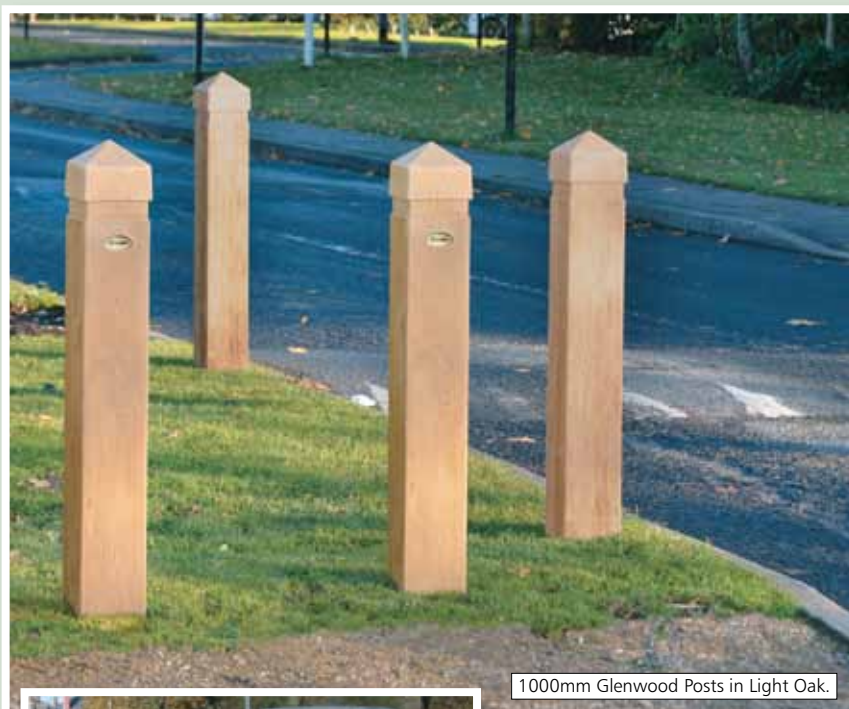
1000mm Glenwood Posts in Light Oak.

Scan to see a successful installation of Glenwood Post. Alternatively, view the 'News' section on our website www.safety4highways.com