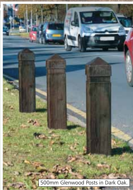
500mm Glenwood Posts in Dark Oak.