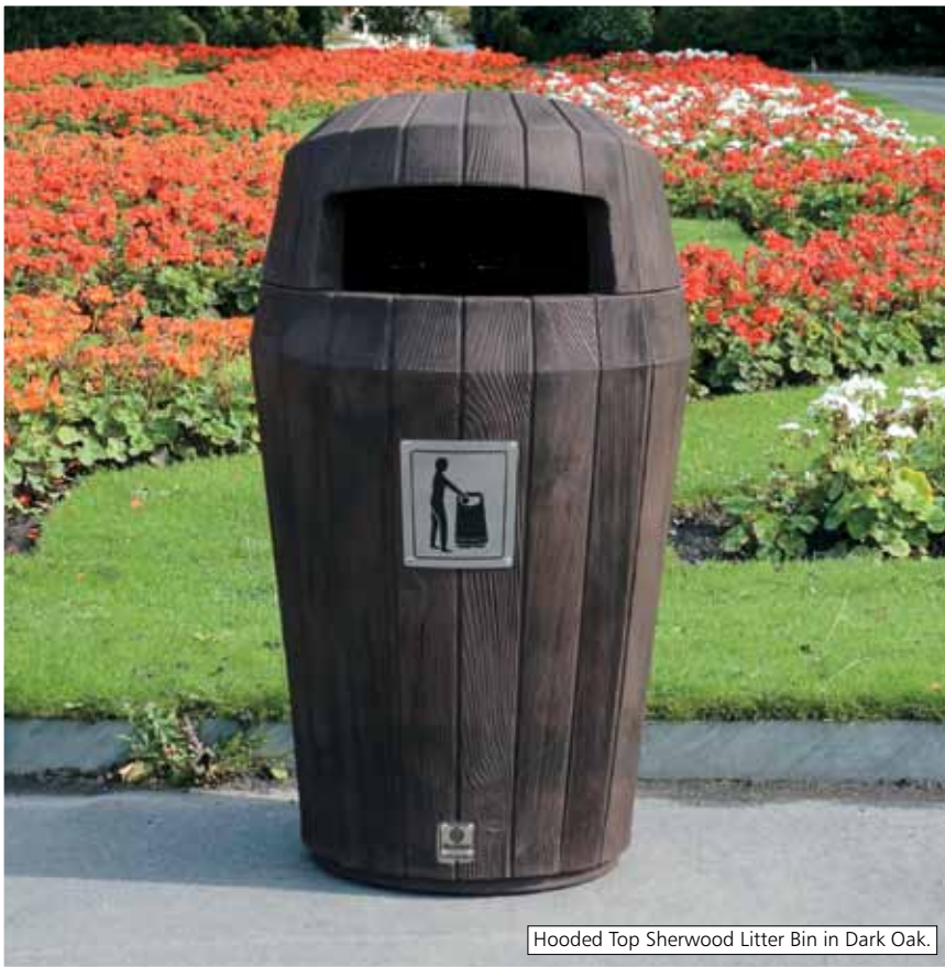
Hooded Top Sherwood Litter Bin in Dark Oak.

Scan to see how Sherwood litter bins have proved to be the perfect choice for Highgate Wood in North London. Alternatively, view the 'News' section on our website www.glasdonlitterbins.com