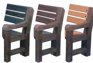
Dark Oak Ends